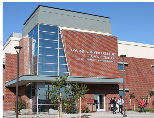
CRC Elk Grove Center

(TAP): Three projects make up Cosumnes River College TAP improvements. The first, completed in October 2005, included a new southern entrance into the campus. The project cost of $366,800 was funded from Measure A. The southwest parking lot was completed in September 2007 and added approximately 550 stalls with $1.3 million of Measure A funds expended on the project. The third project, completed in spring 2010, provided additional parking in the southeast corner and offset the closure of the northeast lot during construction of the parking garage and light rail station. $1.9 million in Measure A funds were used for this project.