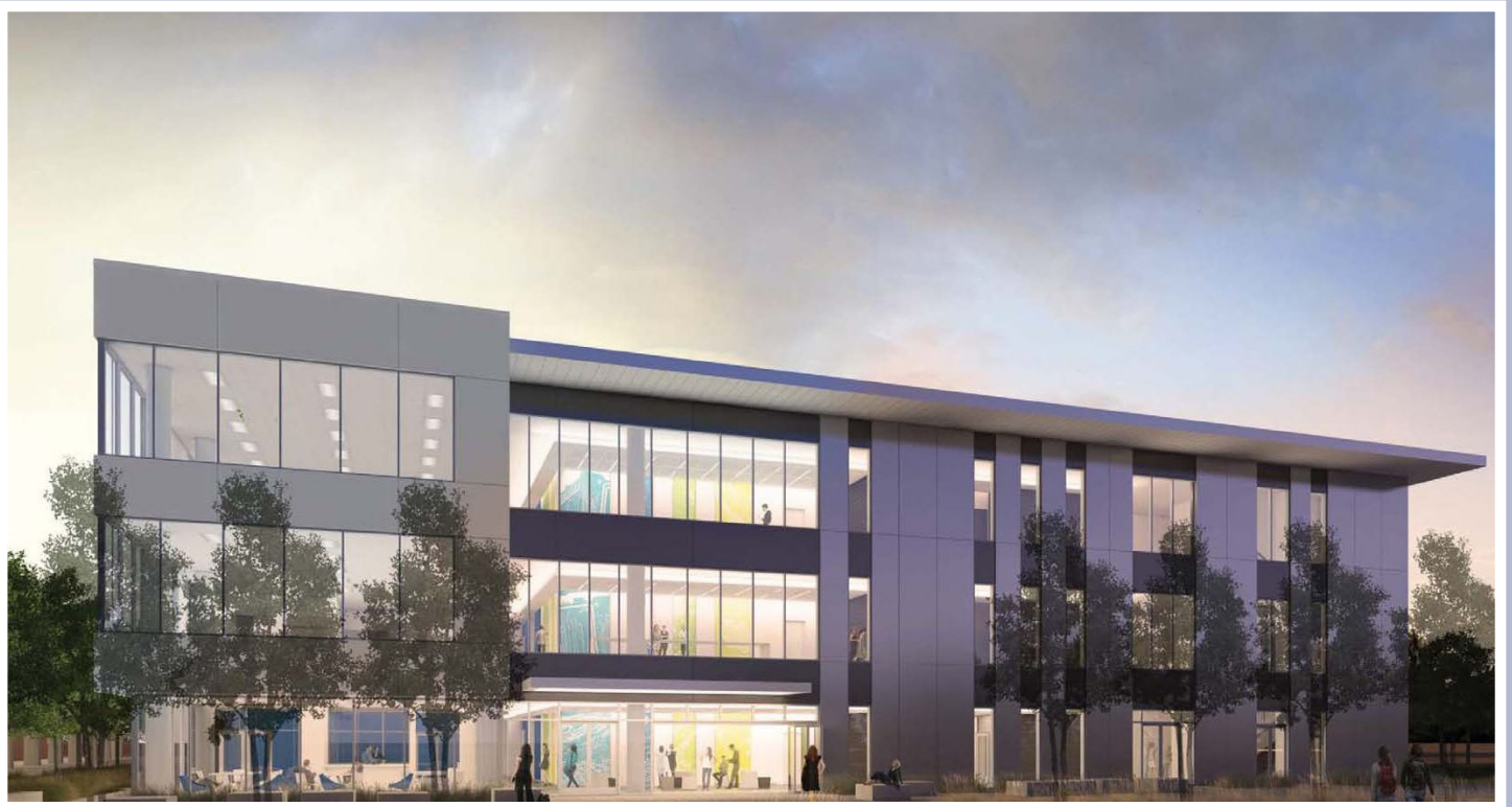
ARC Liberal Arts Modernization