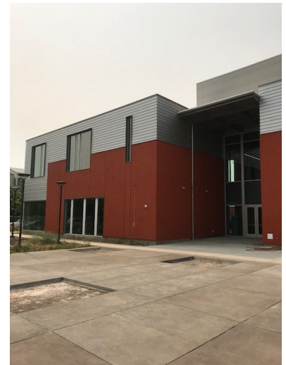
SCC Davis Center Phase 2

TAP Improvements: $1.3 million was appropriated for the final phase of transportation, access and parking improvements at Sacramento City College. This included ADA improvements, pedestrian access improvements, and lighting improvement in various parking lots.