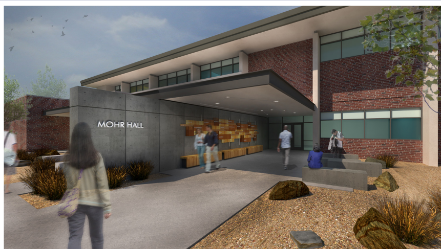
SCC Mohr Hall Modernization

American River College Cosumnes River College Folsom Lake College Sacramento City College