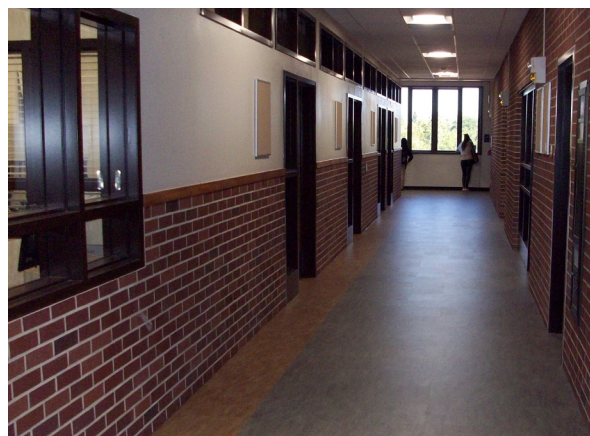
SCC Rodda Hall North 3rd Floor Remodel