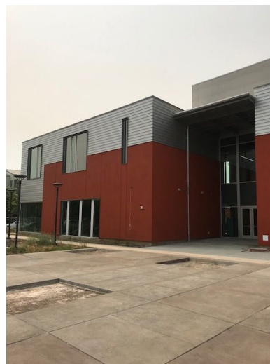
SCC Davis Center Phase 2

TAP Improvements: $1.3 million was appropriated for the final phase of transportation, access and parking improvements at Sacramento City College. This included ADA improvements, pedestrian access improvements, and lighting improvement in various parking lots.