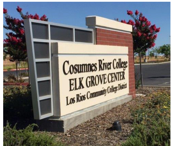
CRC Elk Grove Center Monument Sign

Elk Grove Center Phase 1 TAP and Off-Site Improvements: $1.0 million was appropriated for transportation, access and parking for the Elk Grove Center and $2.4 million for off-site improvements including roadways, a lighted intersection, sidewalks, curb, gutters and associated underground utilities. In addition to the $3.4 million, the City of Elk Grove funded $1.3 million. Work started in spring 2012 and the project was completed in fall 2013.