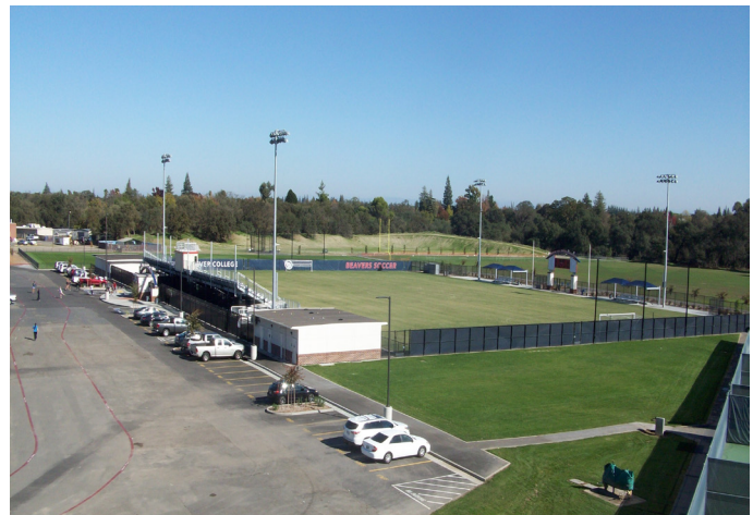
ARC P.E./Athletic Fields Improvements

Existing Swing Space Portable Modification-Liberal Arts (STEM): This project modifies existing temporary housing to accommodate specific instructional programs displaced by the demolition and rebuild of the Liberal Arts building. The $221,000 project from Measure M funds.