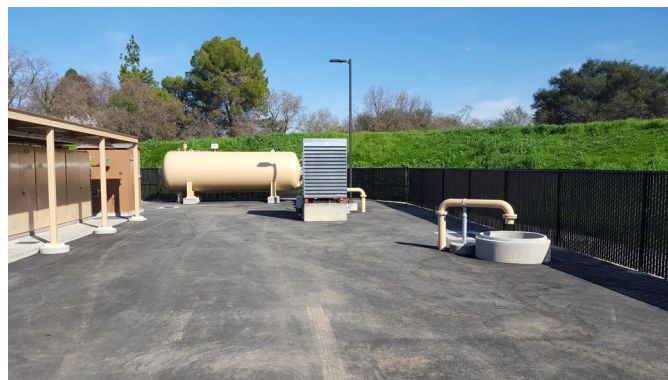
ARC Water Well Replacement

Infrastructure Projects: Currently, $1.2 million is allocated toward completion of an infrastructure master plan and projects at American River College. The project budget is $1.2 million of which $1 million has been expended to date.