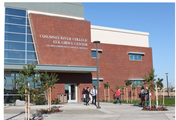
CRC Elk Grove Center

Northeast Buildings Modernization: This project modernized vocational and operational facilities constructed in the 1970's. The project was completed in fall 2012. The State funded $4.8 million toward the project and Measure A contributed $4.1 million.