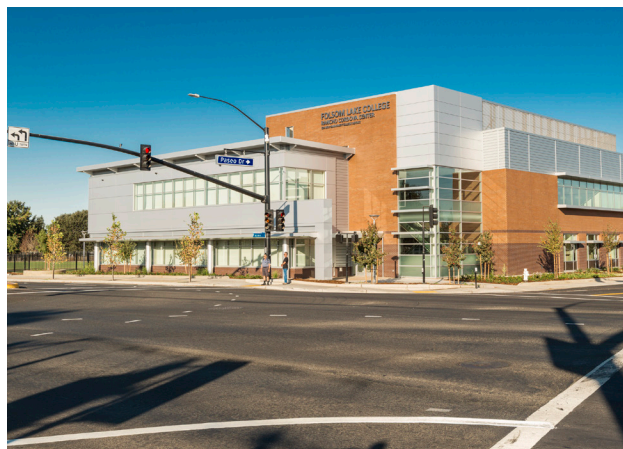
FLC Rancho Cordova Center

Visual and Performing Arts Building Marquee Sign: This electronic marquee sign displays to the community current events and coming attractions to the Harris Center for the Arts regional theater. The project cost $415,000, with $250,000 funded from Measure A. The project was completed in summer 2011.