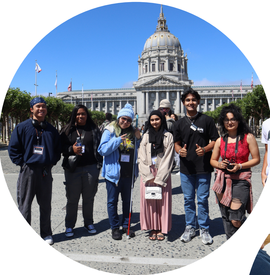
Summer Bridge Trip to the Asian Art Museum (San Francisco, CA)