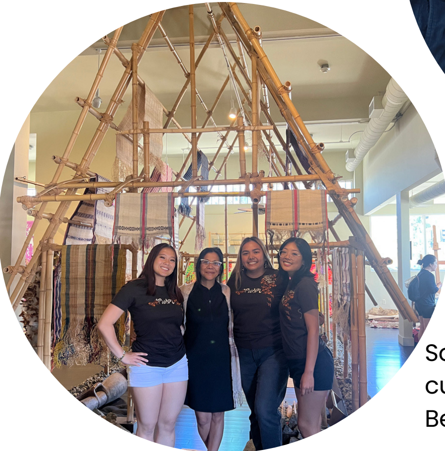
SoCal Summer campus and cultural tours (PIEAM: Long Beach, CA)