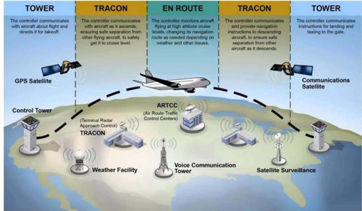
Figure 1: Simplified Overview of Air Traffic Control within the National Airspace