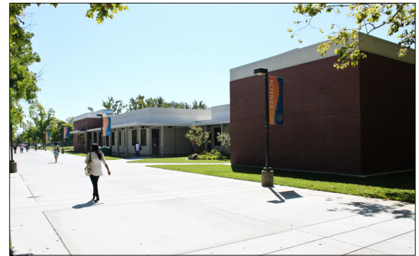
CRC Science Building

Science Building Modernization: Two sequential projects were funded by a combination of Measure A and State funds to modernize and expand the existing science building. The modernization was completed in February 2008 with $4.2 million funded by Measure A funds and $2.5 million of State funds.