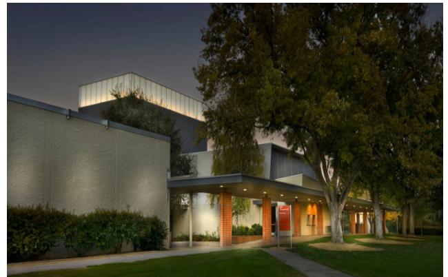
ARC Fine Arts Modernization

Fine Arts Modernization: The Fine Arts building, constructed in 1958, had never had a major renovation. The modernization project was planned in conjunction with a two phase expansion to the facility for a combined estimated cost of $25.1 million. Measure A funds expended for the modernization project totaled $7.6 million with the balance comprised of State and local funds. Modernization of the existing facility was completed in summer 2007.