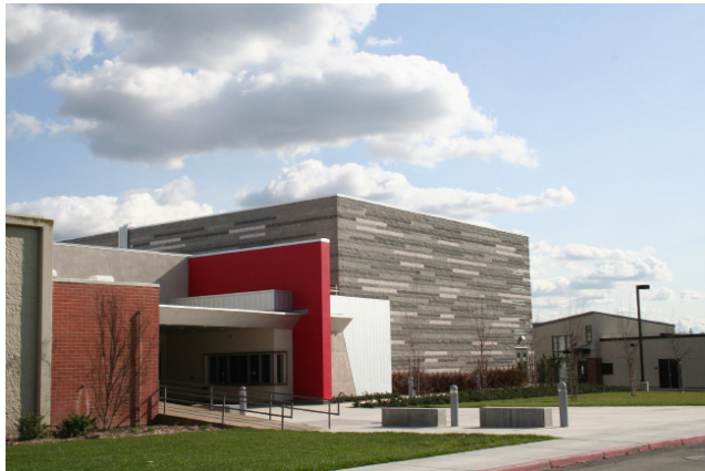
ARC PE Addition

Physical Education Addition Phases 1 and 2: The addition to existing physical education facilities has provided an additional gymnasium, locker room expansion and renovations, and faculty offices. Phases 1 and 2 were combined into one project to maximize cost efficiencies. $9.3 million of Measure A funds were expended. The project was completed and occupied for use in spring 2008.