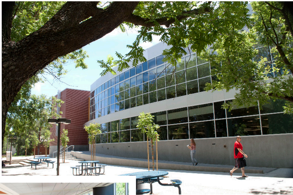
American River College Library Expansion