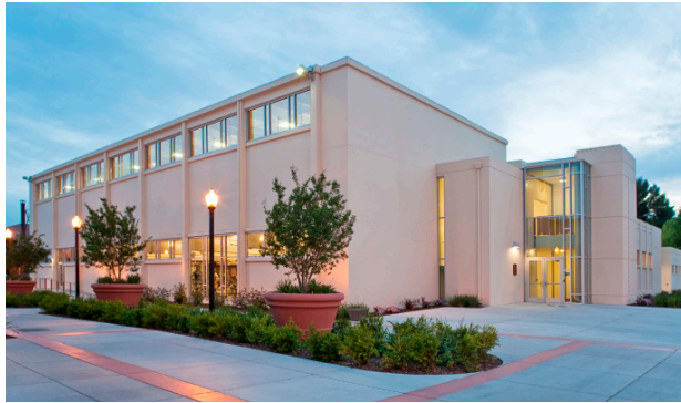
SCC North Gym

in fall 2005. A second phase, which cost $254,400 from Measure A, relocated portables from FLC to SCC. The project has been completed.