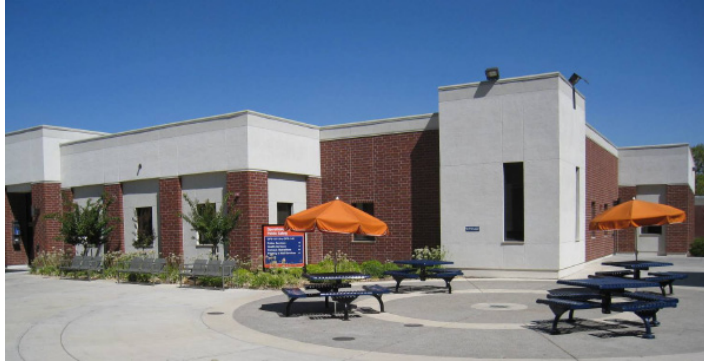
CRC Police/Printing Modernization

Temporary Portables/Swing Space: These portable buildings provide 115,375 gross square feet to house instructional programs displaced during campus modernization projects. Measure A expenditures totaled $588,600.