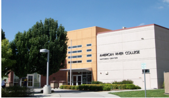
ARC Natomas Center

Allied Health Modernization: Measure A funded $2.4 million of the total cost of $6.0 million. This project replaced old portable classrooms with state-of-the-art permanent Allied Health facilities. The project was completed in January 2004.