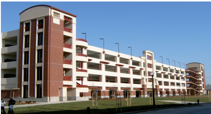
SCC Parking Structure

Fine Arts Modernization: Similar to the other modernizations at Sacramento City College, this facility, built in 1939, had never been renovated. This project cost $5.9 million with $2.1 million contributed by Measure A and $3.8 million funded by the State. The project was completed in fall 2010.