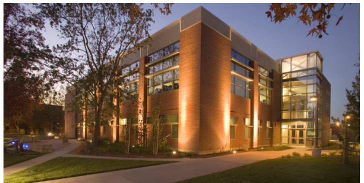
CRC Instructional and Library Building

Bookstore/Cafeteria Expansion: This project was completed in January 2006 and added 5,985 square feet. It was funded by Measure A at $1.1 million.