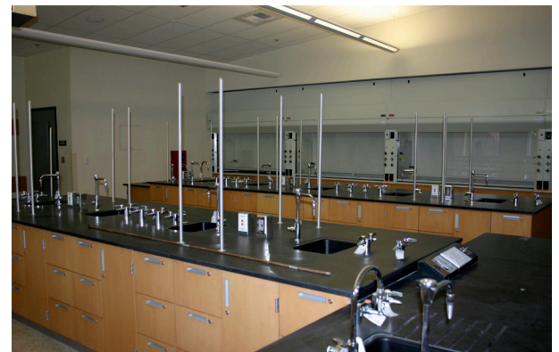
CRC Instructional Lab Expansion

Science Instructional Lab Expansion: This project aids in meeting the increased demand for laboratory space by adding approximately 19,001 square feet of science lab classrooms. The cost of the expansion project was $13.1 million. Measure A funded $5.6 million and $7.3 million was funded by the State. The expansion was completed in summer 2010.