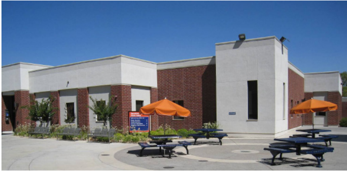
CRC Police/Printing Modernization

Temporary Portables/Swing Space: These portable buildings provide 15,375 gross square feet to house instructional programs displaced during campus modernization projects. Measure A expenditures totaled $588,600.