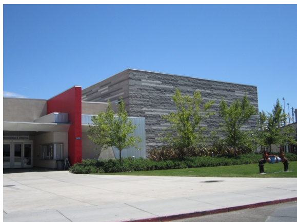
ARC PE Addition

Physical Education Phase 3 (pool): The original pool at ARC was built in 1961. This $2.7 million expansion and upgrade project, funded with a combination of Measure A funds, $2.1 million, college resources, $270,000, and Scheduled Maintenance, Special Repair funds, $300,000, was completed in September 2008.