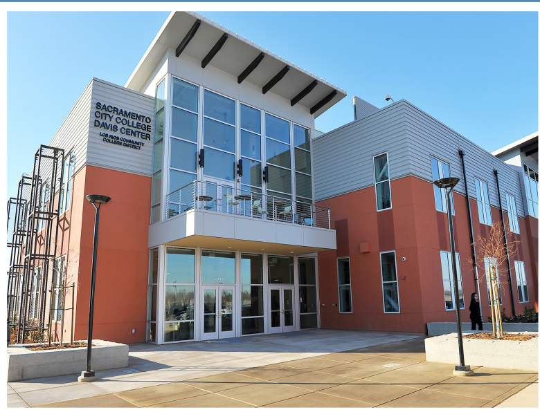
Sacramento City College- Davis Center

American River College Cosumnes River College Folsom Lake College Sacramento City College