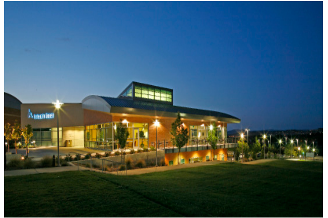
FLC Bookstore and Cafeteria

Rancho Cordova Center: Measure A is providing $13.3 million to acquire and develop the site and complete construction for the new Rancho Cordova Center. To date, $731,200 of Measure A funds have been expended.