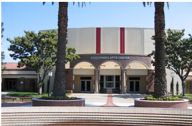
SCC Performing Arts Center

Performing Arts Modernization: 49,469 square feet of space was renovated and rebuilt with a combination of funding from Measure A, $3.8 million, and State bonds, $14 million. The project was completed in spring 2012. Expenditures to date total $2.9 million.