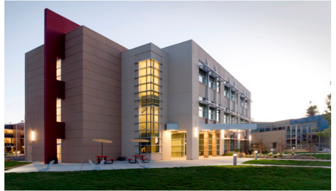
SCC West Sacramento Center

West Sacramento Center Phase 1: In December 2004, the District completed the acquisition of the site for the West Sacramento Center at a cost of $1.5 million. The Center has been master planned in conjunction with the City of West Sacramento. Construction started in summer 2008 at a total cost of $11.5 million, including the site acquisition, from Measure A. The Phase 1 project was completed in December 2009 and opened for the spring 2010 term.