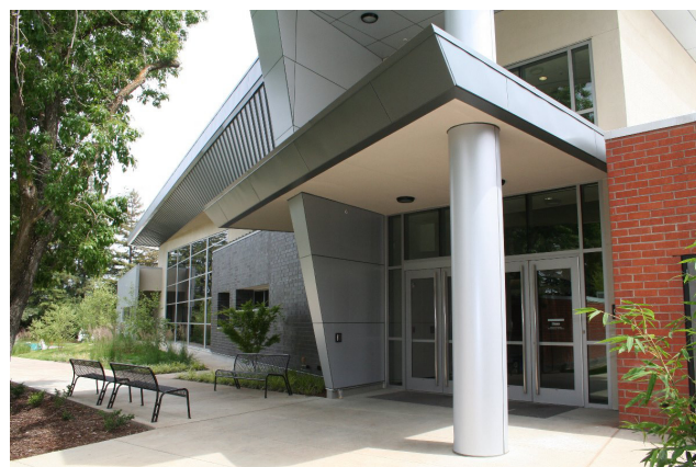
ARC Learning Resource Center Expansion

Learning Resource Center Expansion: The Learning Resource Center expansion provides an additional 19,140 square feet of library and resource center facilities. The project was budgeted for $11.0 million with $450,100 funded from Measure A, and the balance from State funds. The construction of this project was completed in February 2006. The total Measure A expenditures were $450,100.