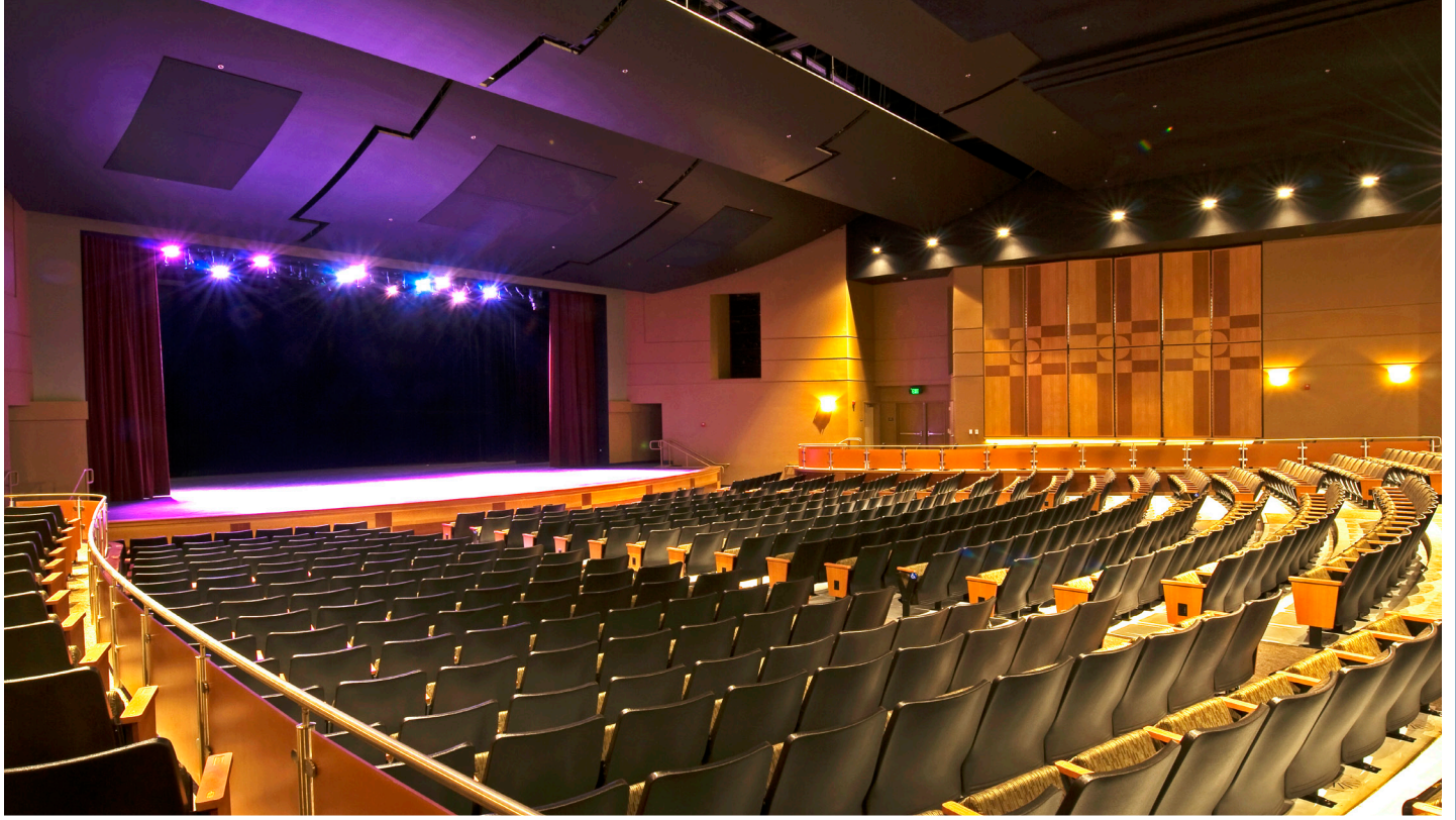
Sacramento City College Performing Arts Center