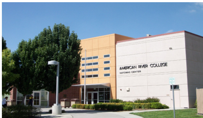
ARC Natomas Center

Allied Health Modernization: Measure A funded $2.4 million of the total cost of $6.0 million. This project replaced old portable classrooms with state-of-the-art permanent Allied Health facilities. The project was completed in January 2004.