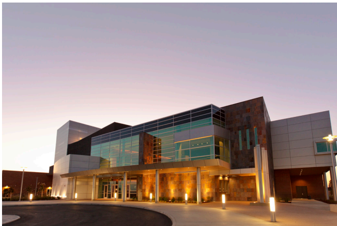
FLC Three Stages Visual and Performing Arts Building

Bookstore/Cafeteria Expansion: An additional 13,597 square feet of space for faculty offices, meeting rooms, and Cafeteria was realized with the completion of this project in spring 2012. The total budget is $5.1 million from Measure A. Expenditures thus far total $5.0 million.