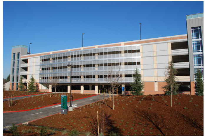
ARC Parking Structure

Parking Structure and TAP: Chronic parking and circulation issues at the College have been alleviated with the construction of a 1,650 space parking garage, as well as other improvements. Measure M appropriations total $27.2 million. To date, $24.2 million has been expended.