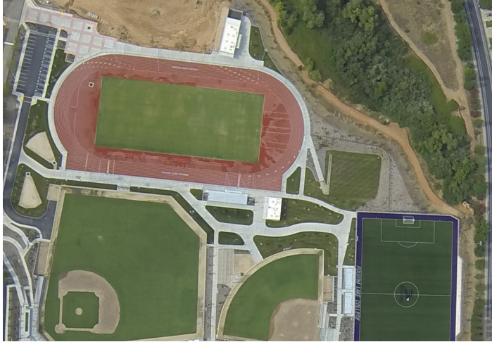
FLC Physical Education and Athletics Fields Construction

Visual and Performing Arts Building: The new Visual and Performing Arts facility at Folsom Lake College (Harris Center for the Arts) provides classroom facilities, theaters, staff and faculty offices, and related facilities supporting the Fine and Performing Arts programs. This $50 million project was funded with $11.4 million from the State, $28.1 million from Measure A, and the balance from local sources. The project was completed in fall 2010 and fully operational in spring 2011.