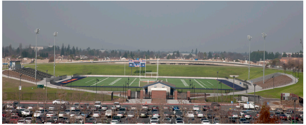
CRC Physical Education and Athletic Fields

$14.8 million is allocated to complete the College's Physical Education and Athletic fields, perimeter landscaping, and parking improvements. Modernization of the stadium and sports fields also accommodates local high school sporting events through a partnership with Elk Grove Unified School District (EGUSD). Community usage is also planned. Measure A to date totals $11.7 million. Total project funding is $13.1 million from Measure M and $1.7 million from EGUSD and the balance from the College.