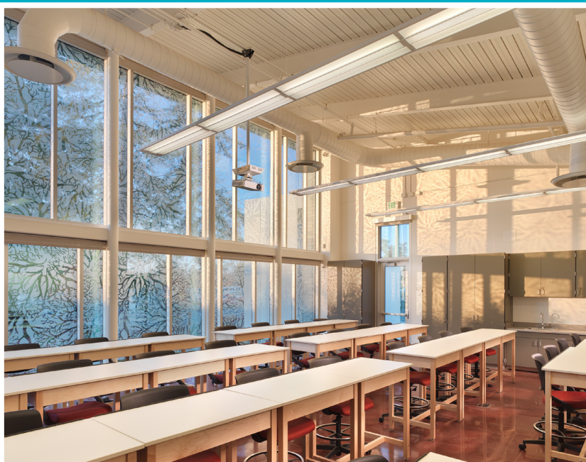
American River College Life Science / Fine Arts Modernization

American River College Cosumnes River College Folsom Lake College Sacramento City College