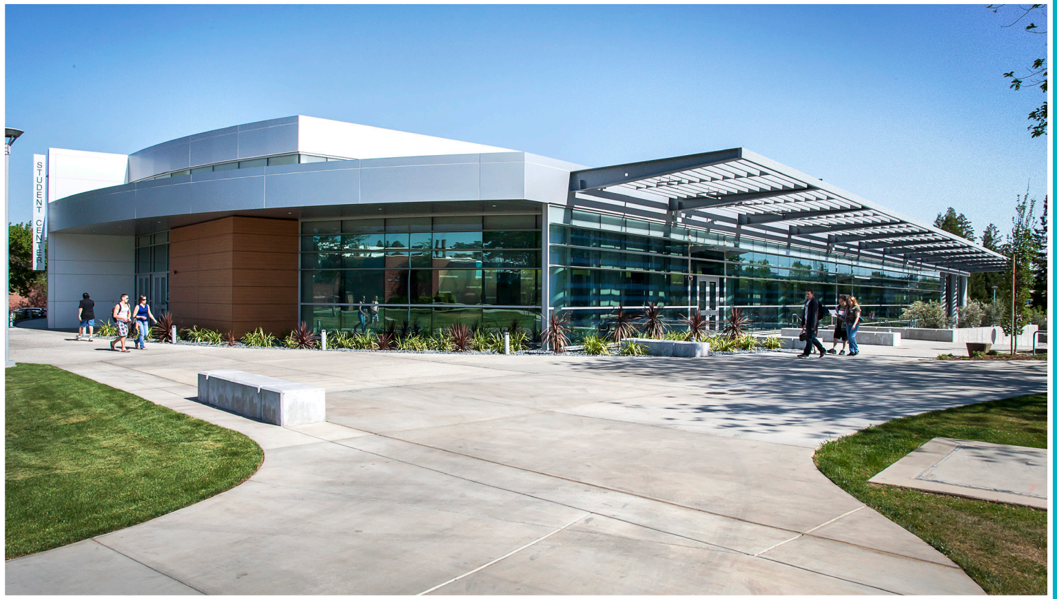
American River College Student Center