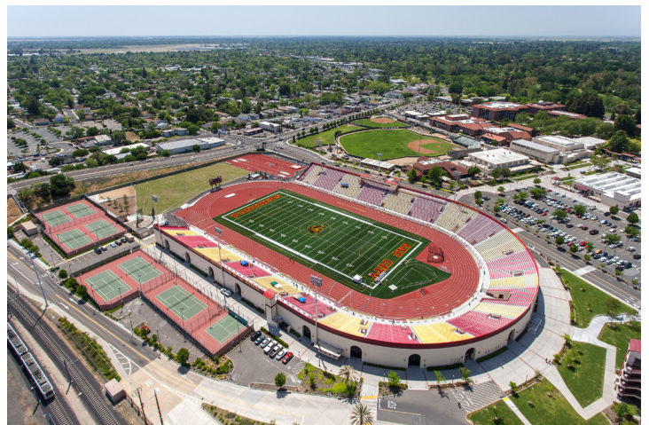
SCC Hughes Stadium

Hughes Stadium Modernization: This facility has historic significance to many Sacramentans. It has long been used by the Physical Education and Athletic program at the College as well as for high school and community athletic events. The modernization was necessary to meet seismic, ADA, and other requirements as well as to update facilities constructed in the 1930's. Measure M contributed $13.1 million.