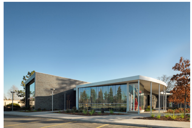
ARC Life Science & Fine Arts Modernization

Natomas Center Phase 1: This project was completed on time for the start of the fall 2005 semester. The facility is part of a joint project with Natomas Unified and the Sacramento County Library Authority. $8.2 million of Measure A funds were expended for Phase 1, including the site acquisition at $1.7 million.