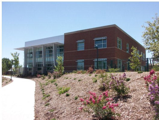
Architecture and Construction Programs Instructional Building

Elk Grove Center Phase 1 TAP and Off-Site Improvements: $1.0 million was appropriated for transportation, access and parking for the new Elk Grove Center and $2.4 million for off-site improvements including roadways, a lighted intersection, sidewalks, curb, gutters and associated underground utilities. In addition to the $3.4 million, the City of Elk Grove funded $1.3 million. Work started in spring 2012 and the project was completed in fall 2013.