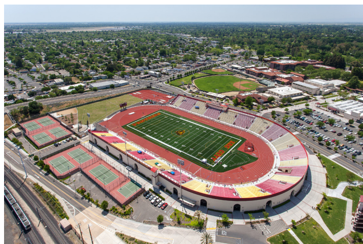
SCC Hughes Stadium

TAP Improvements: $1.2 million was appropriated for the final phase of transportation, access and parking improvements at Sacramento City College.