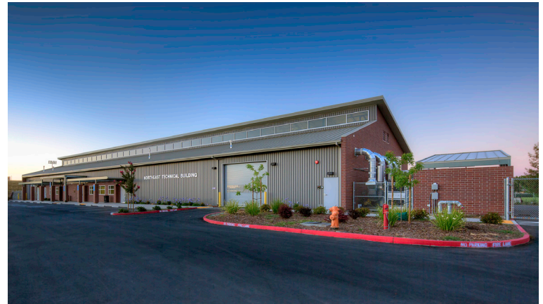
CRC Northeast Buildings Modernization

Bookstore/Cafeteria Expansion: This project was completed in January 2006 and added 5,985 square feet. It was funded by Measure A at $1.1 million.