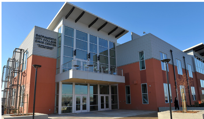
SCC Davis Center

Cosmetology and Graphics Modernization: This project modernized the facility constructed in 1951. Measure A contributed $1.9 million and the State funded $1.1 million. The project was completed in July 2006.