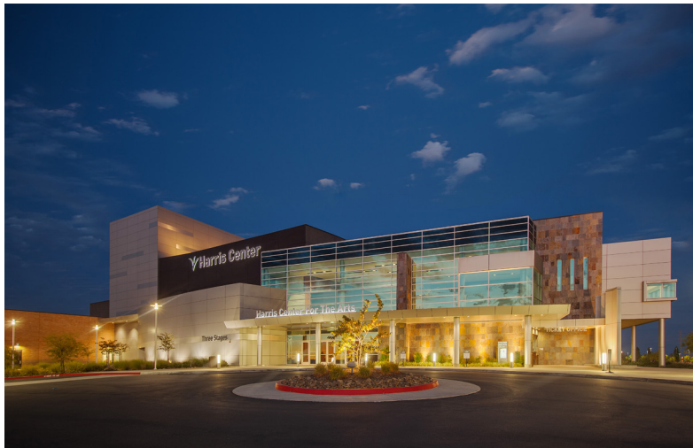
FLC Harris Center for the Arts

Monument Signs: Expenditures totaled $170,000 on this project, with $84,800 from Measure A and $84,800 funded by the College. The monument signs are at the main entrance to the College on East Bidwell Street and were completed in January 2008.