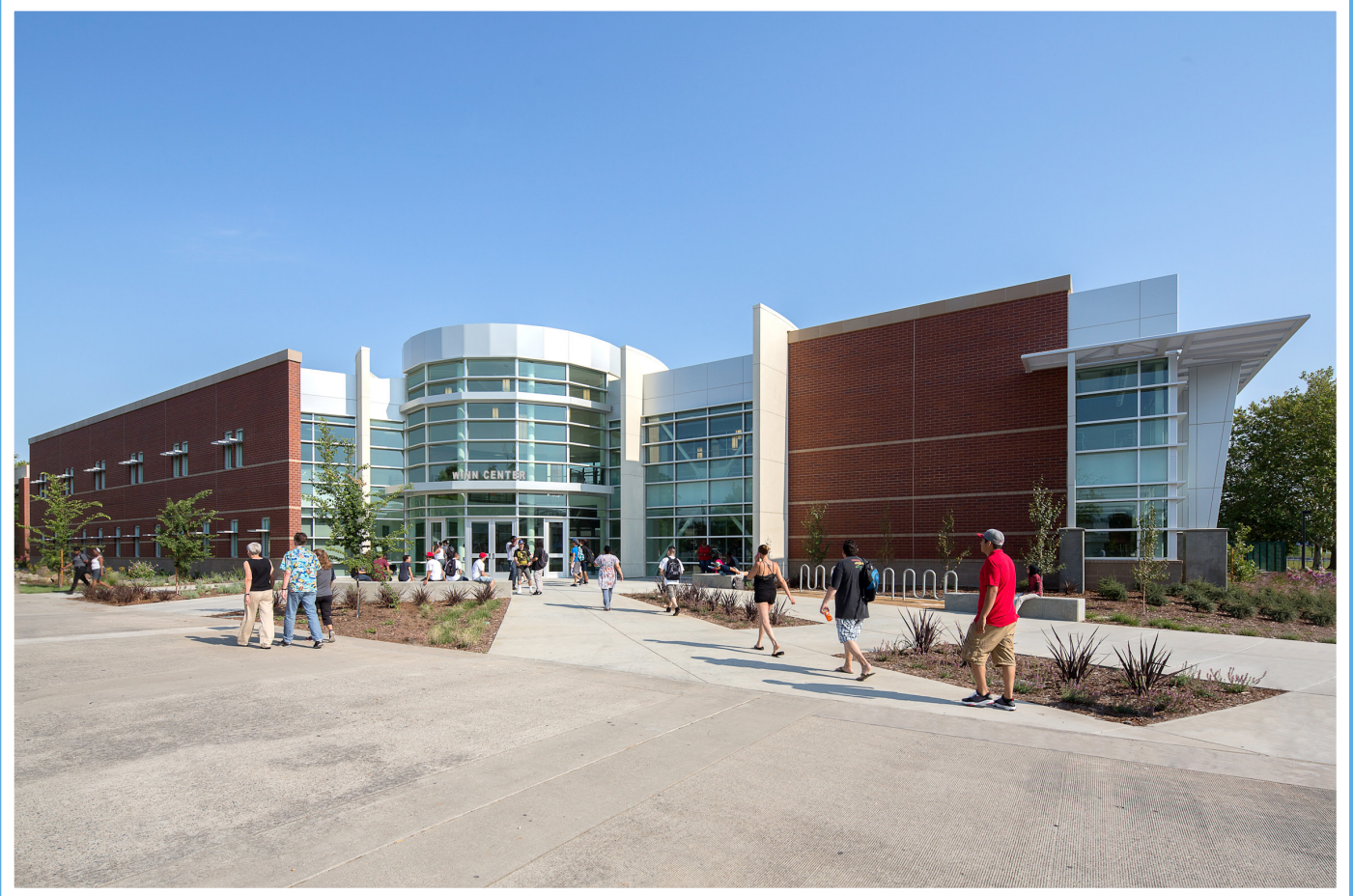
Cosumnes River College Winn Center