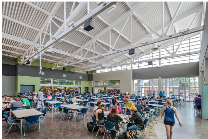
ARC Student Center Modernization and Expansion

Student Center Modernization and Expansion: This $21 million project funded primarily by Measure M proceeds modernized (replaced) and expanded the former cafeteria, office space and meeting rooms adding 34,701 assignable square feet. The Center opened in spring 2013.