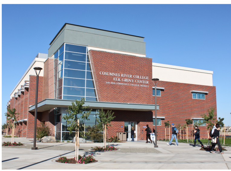
Cosumnes River College Elk Grove Center

American River College Cosumnes River College Folsom Lake College Sacramento City College