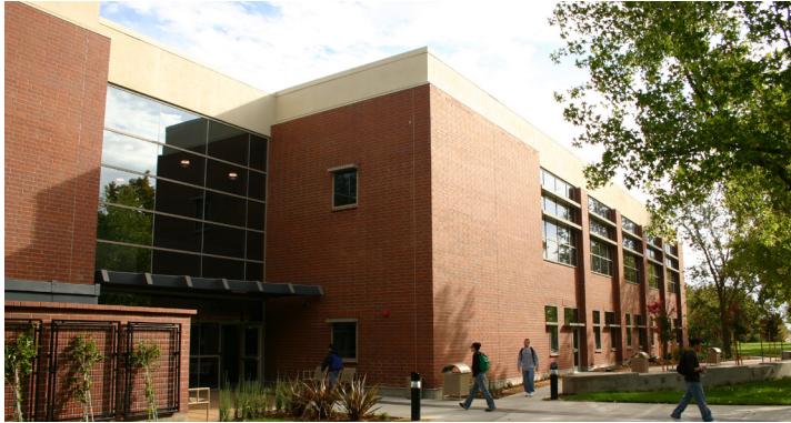
CRC Instructional and Library Building

Science Instructional Lab Expansion: This project aids in meeting the increased demand for laboratory space with the addition of 19,001 square feet of science lab classrooms. The cost of the expansion project was $12.9 million. Measure A funded $5.6 million and $7.3 million was funded by the State. The expansion was completed in summer 2010.