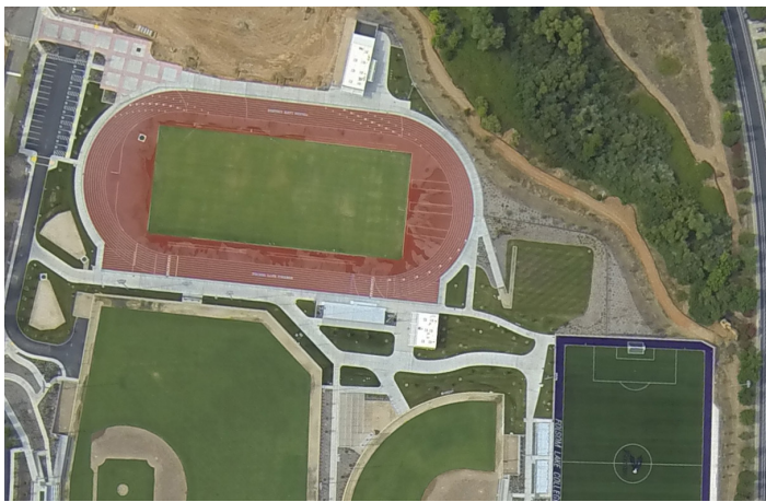
FLC Physical Education and Athletics Fields Construction

Rancho Cordova Center Phase I TAP and Off-Site Improvements: $1.2 million has been appropriated for transportation, access, and parking for the Rancho Cordova Center and $1.3 million has been allocated for off-site improvements for the Center which is located adjacent to the light rail line. Thus far, $83,800 has been expended for design of the off-site improvements and $163,000 for TAP projects.