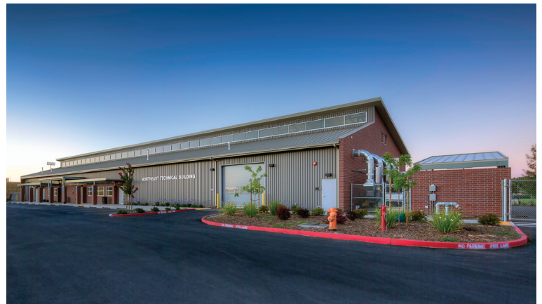
CRC Northeast Buildings Modernization