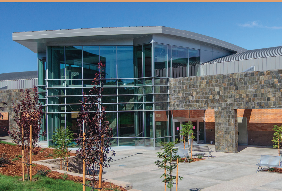
Folsom Lake College Gymnasium

American River College Cosumnes River College Folsom Lake College Sacramento City College