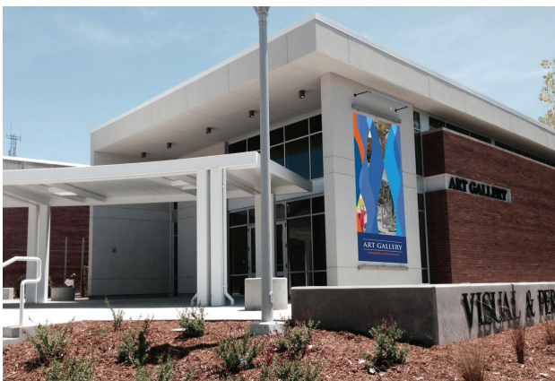
CRC Art Gallery

Art Gallery Space: Construction of the Art Gallery space was completed in spring 2015. This completes the campus' comprehensive Fine and Performing Arts facilities. $2.1 million is funded by Measure M and $2.0 million has been expended so far.