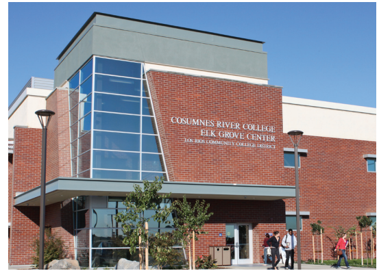
CRC Elk Grove Center

Swing Space for Bookstore/Cafeteria Expansion, Phase 2: Temporary swing space was developed for use during the second phase of the Bookstore/Cafeteria Expansion. Measure A funded the swing space, which was completed in June 2010, at a cost of $184,000.