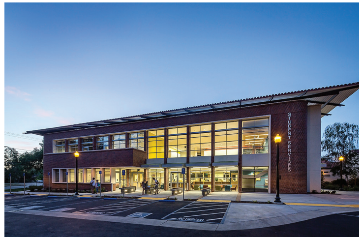
SCC Student Services Modernization and Expansion

Infrastructure Projects: $193,700 is currently allocated toward completion of a master plan that will incorporate the infrastructure needs for current and future facilities at Sacramento City College. To date, $193,700 has been expended.