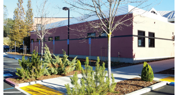
FLC El Dorado Center Expansion

Physical Education and Athletics Fields Construction: This project is one of the elements of Folsom Lake College's master plan. The project provides facilities to support the College's Physical Education and Athletic programs in addition to serving local community needs. Measure M funds were allocated at $19.0 million with $100,000 being funded by the City of Folsom. $19.1 million has been expended to date.