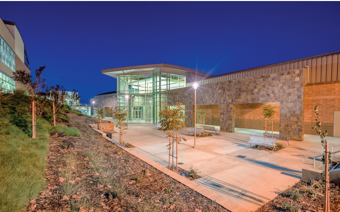
FLC Physical Education Gymnasium

Bookstore/Cafeteria Expansion: An additional 13,597 square feet of space for faculty offices, meeting rooms, and cafeteria was realized with the completion of this project in spring 2012. The total budget was $5.1 million from Measure A.