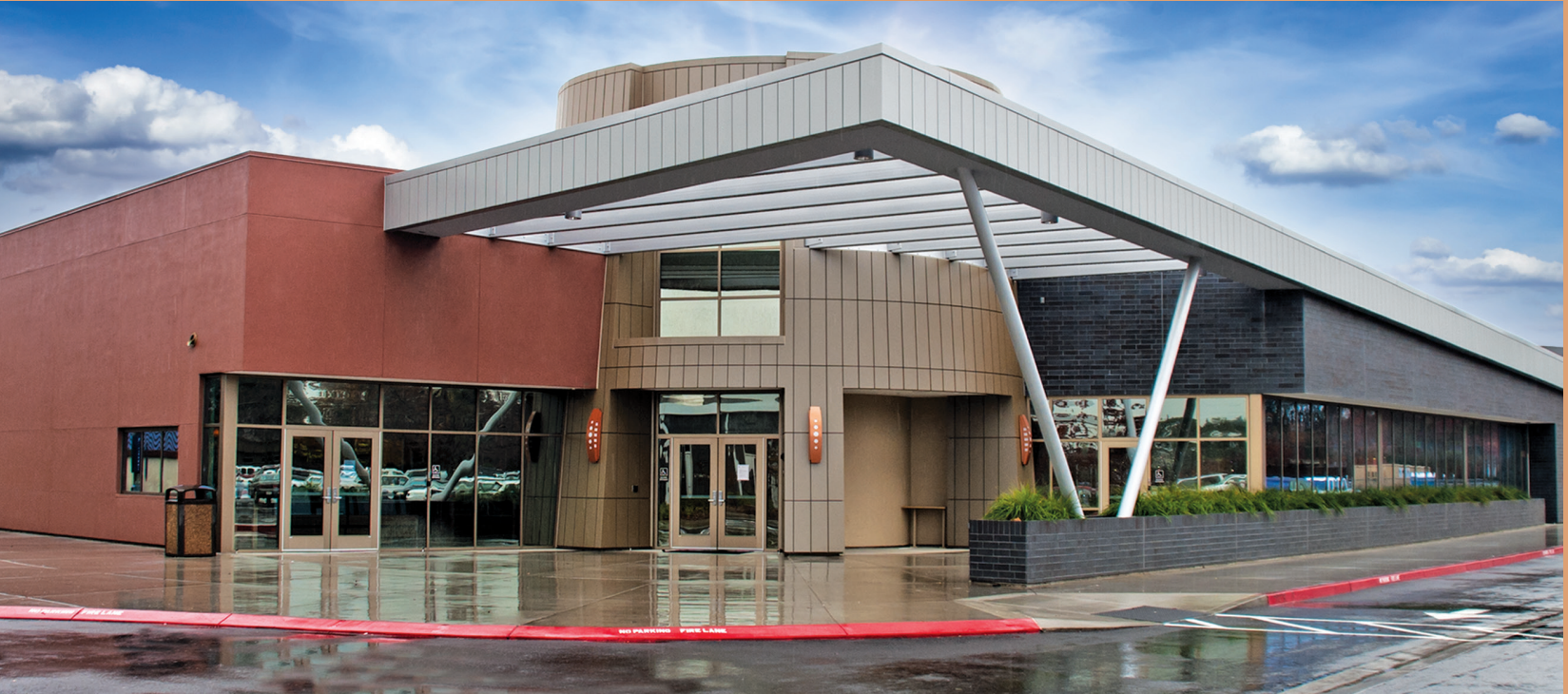
American River College Culinary Arts Building