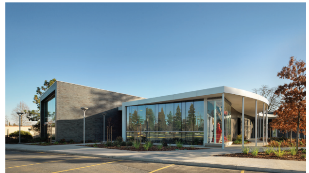
ARC Life Science & Fine Arts Modernization

Temporary Portables/Swing Space: These portable buildings were operational for fall 2005, and provide almost 23,454 square feet to house instructional programs displaced during modernization projects. The Measure A cost was $1.4 million.