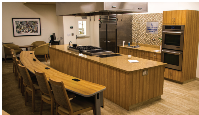
ARC Culinary Arts Demonstration Kitchen

Student Center Modernization and Expansion: This $21 million project funded primarily by Measure M proceeds modernized (replaced) and expanded the former cafeteria, office space and meeting rooms adding 34,701 assignable square feet. The Center opened in spring 2013.