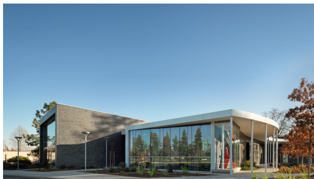
ARC Life Science & Fine Arts Modernization

Allied Health Modernization: Measure A funded $2.4 million of the total cost of $6 million. This project replaced old portable classrooms with state-of-the-art permanent Allied Health facilities. The project was completed in January 2004.