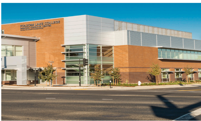
Folsom Lake College Rancho Cordova Center

American River College Cosumnes River College Folsom Lake College Sacramento City College