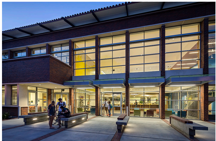
SCC Student Services Modernization and Expansion

TAP Improvements: $1.3 million was appropriated for the final phase of transportation, access and parking improvements at Sacramento City College. This included ADA improvements, pedestrian access improvements, and lighting improvement in various parking lots.