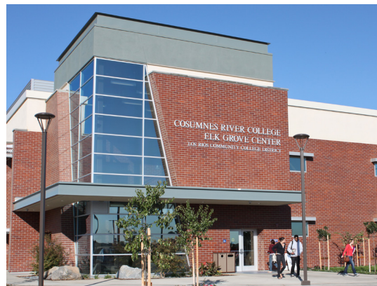
CRC Elk Grove Center

(TAP): Three projects make up Cosumnes River College TAP improvements. The first, completed in October 2005, included a new southern entrance into the campus. The project cost of $366,800 was funded from Measure A. The southwest parking lot was completed in September 2007 and added approximately 550 stalls with $1.3 million of Measure A funds expended on the project. The third project, completed in spring 2010, provided additional parking in the southeast corner and offset the closure of the northeast lot during construction of the parking garage and light rail station. $1.9 million in Measure A funds were used for this project.