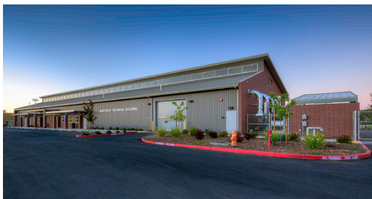
CRC Northeast Buildings Modernization