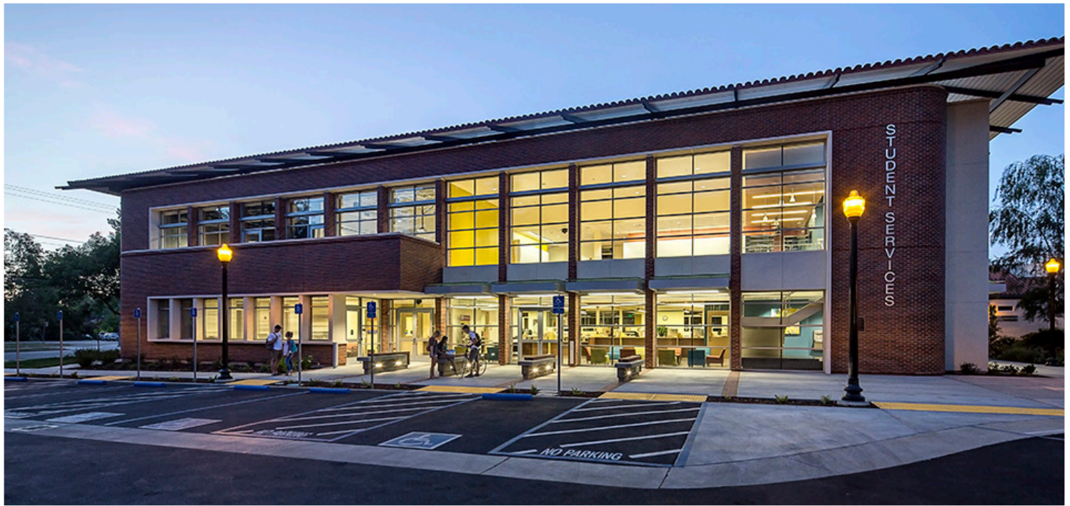
Sacramento City College Student Services Building