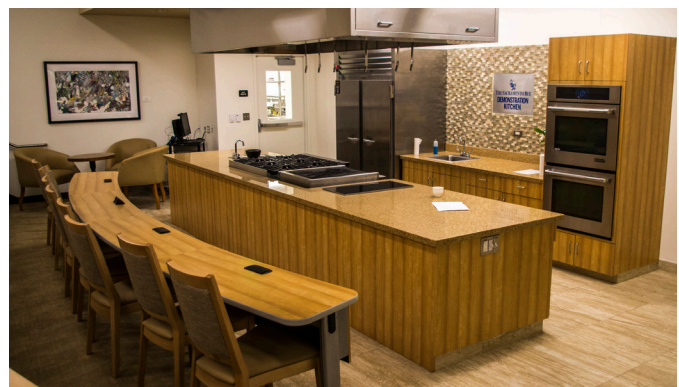
ARC Culinary Arts Demonstration Kitchen

Culinary Arts Building: This $10 million dollar project is primarily funded by Measure M, with $1 million in contributions from the Foundation Capital Campaign. The project has an instruction laboratory complete with a new kitchen, servery and dining area for the comprehensive culinary program. $9 million has been spent out of Measure M funds.