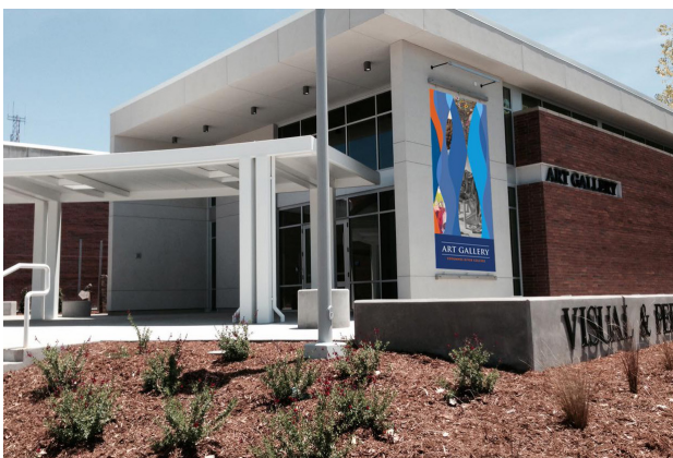
CRC Art Gallery

College Center Expansion: This project will provide a 18,005 ASF expansion to the College Center building. The expansion will be used for student services, administration and counseling. The project budget is $12.8 million, all funded by Measure M. $99,000 has been expended to date.