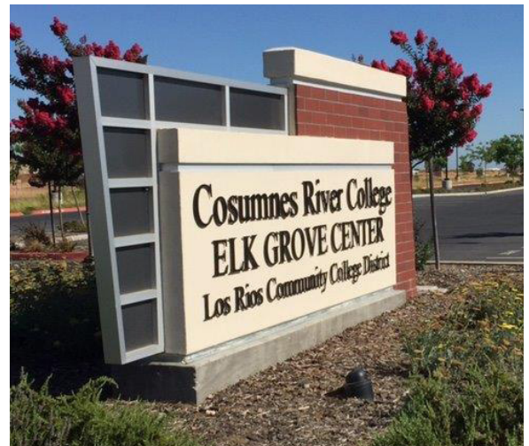
CRC Elk Grove Center Monument Sign

Elk Grove Center Phase 1 TAP and Off-Site Improvements: $1.0 million was appropriated for transportation, access and parking for the Elk Grove Center and $2.4 million for off-site improvements including roadways, a lighted intersection, sidewalks, curb, gutters and associated underground utilities. In addition to the $3.4 million, the City of Elk Grove funded $1.3 million. Work started in spring 2012 and the project was completed in fall 2013.