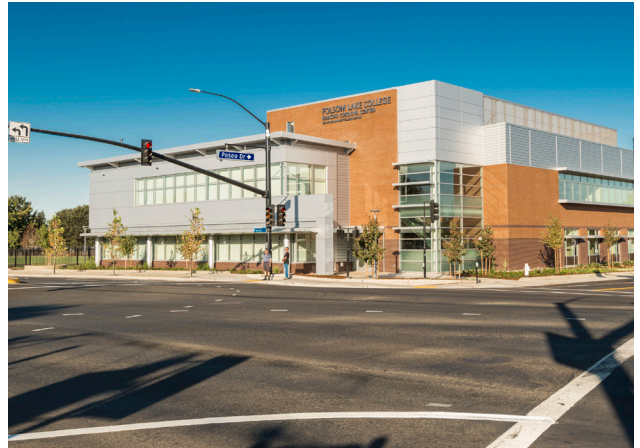
FLC Rancho Cordova Center

Visual and Performing Arts Building Marquee Sign: This electronic marquee sign displays to the community current events and coming attractions to the Harris Center for the Arts regional theater. The project cost $415,000, with $250,000 funded from Measure A. The project was completed in summer 2011.