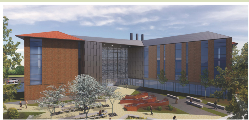
SCC Lillard Hall Science Building

American River College Cosumnes River College Folsom Lake College Sacramento City College