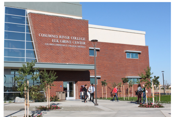
CRC Elk Grove Center

Expansion of the Bookstore and Cafeteria resulted in an additional 14,114 square feet of space. Total cost was $4.3 million funded by Measure A. Construction commenced in spring 2010 and was completed in the summer of 2011.