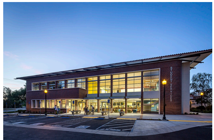
SCC Student Services Modernization and Expansion