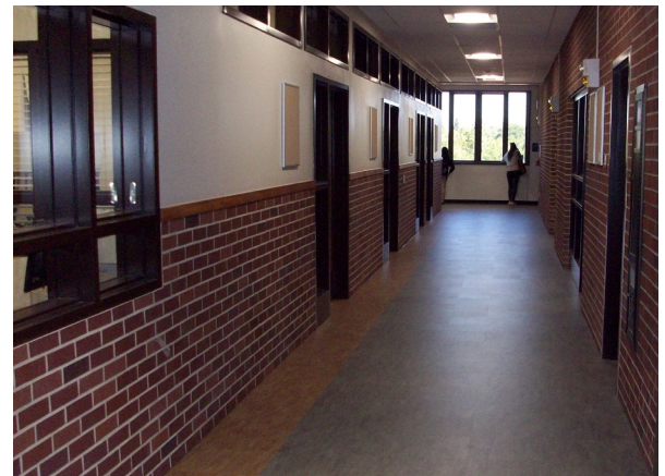
SCC Rodda Hall North 3rd Floor Remodel