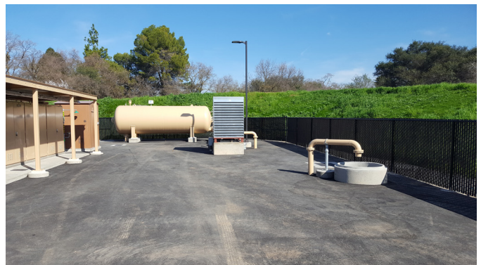
ARC Water Well Replacement

Infrastructure Projects: Currently, $1.2 million is allocated toward completion of an infrastructure master plan and projects at American River College. The project budget is $1.2 million of which $1 million has been expended to date.