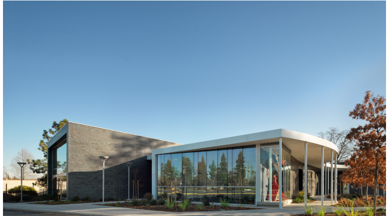
ARC Life Science & Fine Arts Modernization

Allied Health Modernization: Measure A funded $2.4 million of the total cost of $6 million. This project replaced old portable classrooms with state-of-the-art permanent Allied Health facilities. The project was completed in January 2004.