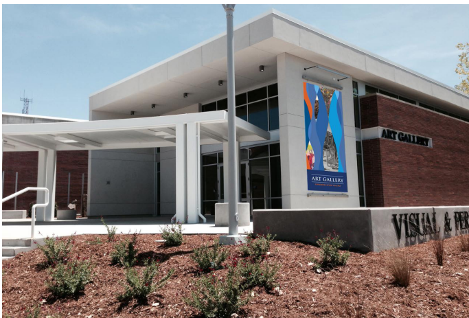
CRC Art Gallery

Science Instructional Lab Expansion: This project helps meet the increased demand for laboratory space with the addition of 19,001 square feet of science lab classrooms. The cost of the expansion project was $12.9 million. Measure A funded $5.6 million, and $7.3 million was funded by the state. The expansion was completed in summer 2010.