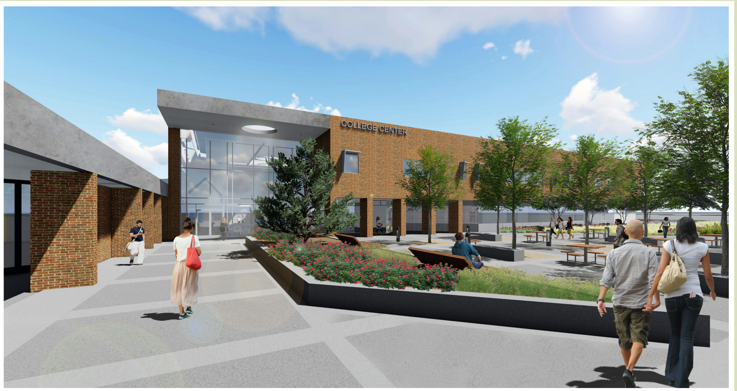
CRC College Center Expansion