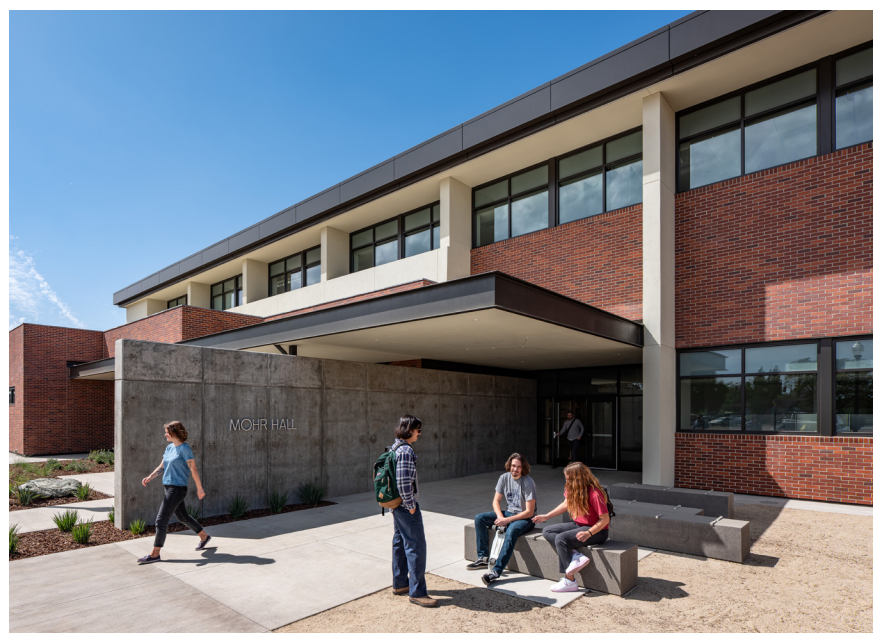
SCC Mohr Hall

Swing Space Portable - Mohr Hall: This project will provides temporary portables to be used for instruction during the replacement of Mohr Hall. Measure M funded this project at $283,000.