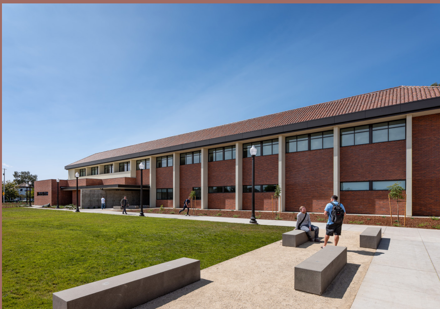
SCC Mohr Hall

American River College Cosumnes River College Folsom Lake College Sacramento City College