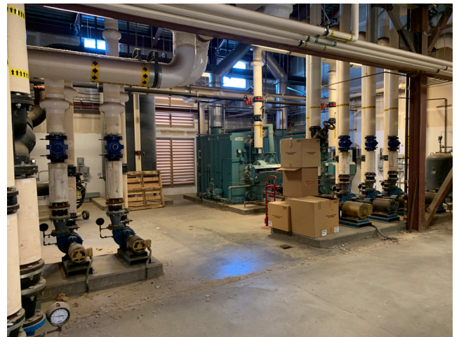
FLC Central Plant Upgrade

This project provides for the addition of 48,900 asf of new Instructional space specifically for Science. Scope of work includes classrooms (8,800 asf), Physical Science (28,900 asf), Faculty Offices (9,400 asf) and Library space (1,800 asf). The projected is budgeted for $49.5 million with $2.4 million in expenditures to date