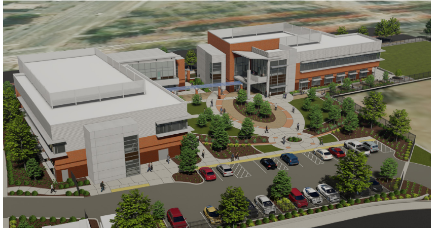
FLC Rancho Cordova Center Phase 2

The Project builds new 14,200 assignable square feet instructional facility adjacent to the existing FLC Rancho Cordova Center building. The new building will provide space for instruction in general education and biology and provides ADA access compliance and adequate HVAC power, technology and lighting systems to support these instructional programs. This includes 3,200 asf of lecture space 9,500 asf of lab space and 600 asf of office/admin and 900 asf of miscellaneous support space. The budget is $19.2 million with $344,000 in expenditures to date.