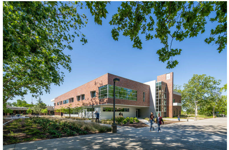
CRC College Center Expansion

This project provides improvements to the underground infrastructure – hydronics and utilities, that serve the College Center Expansion. The project budget is $2.9 million with $2.9 million expended to date.