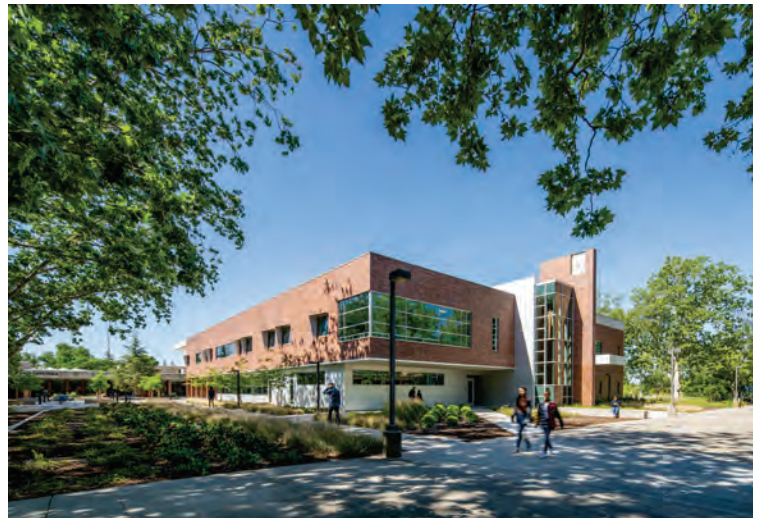
CRC College Center Expansion

Abate and remove 5 portables on the CRC campus. Buildings include Portable 76 adjacent PE and old temp housing buildings near the tennis court. Buildings are past their useful life and no longer needed. Measure M contributed $99,000 to this project.