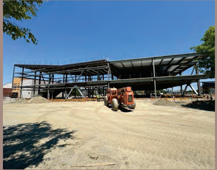
Natomas Center Phase 2 and 3, American River College