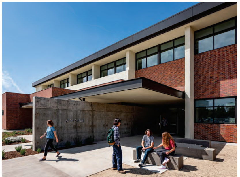
SCC Mohr Hall

Davis Center TAP Phase 2: This project provides transportation, access, and parking expansion and improvements related to the phase 2 instructional building. Measure M funded the entire $883,000 for this project.