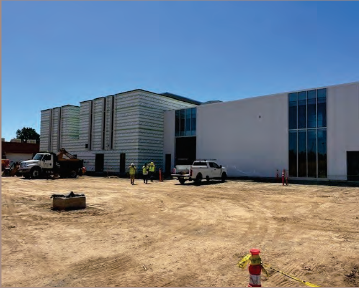
Tech Ed Modernization, American River College