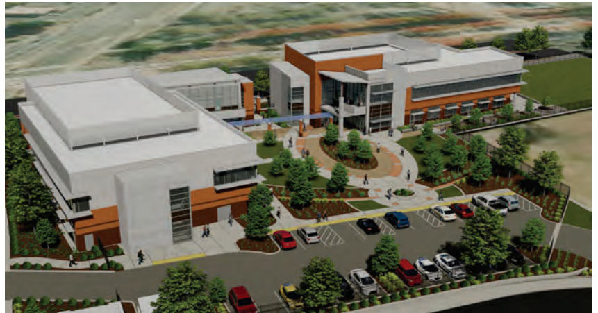
FLC Rancho Cordova Center Phase 2

This project will support the Rancho Cordova Center by expanding the offsite parking lot across from Paseo Drive to provide approximately 66 additional parking stalls. The project budget is $3 million with $1.56 million in expenditures to date.