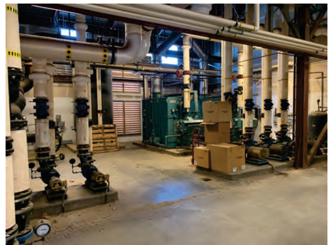
FLC Central Plant Upgrade

This project provides for the addition of 48,900 asf of new Instructional space specifically for Science. Scope of work includes classrooms (8,800 asf), Physical Science (28,900 asf), Faculty Offices (9,400 asf) and Library space (1,800 asf). The projected is budgeted for $53.2 million with $5.8 million in expenditures to date.