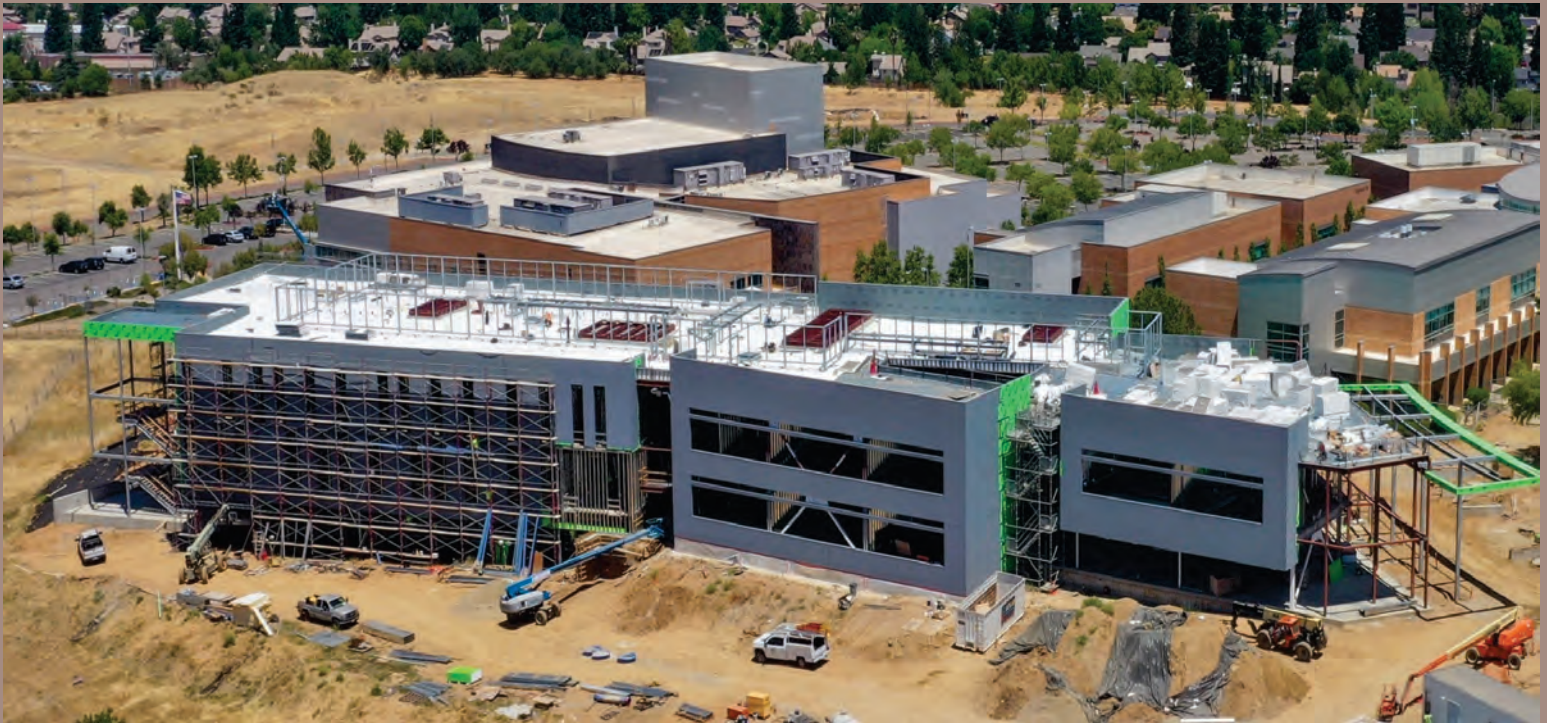
Science 2.1, Folsom Lake College

American River College Folsom Lake College