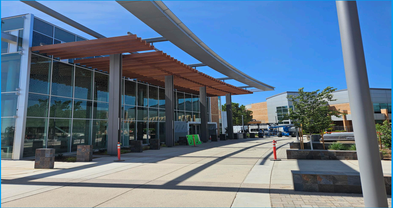
Science 2.1, Folsom Lake College

American River College Cosumnes River College Folsom Lake College Sacramento City College