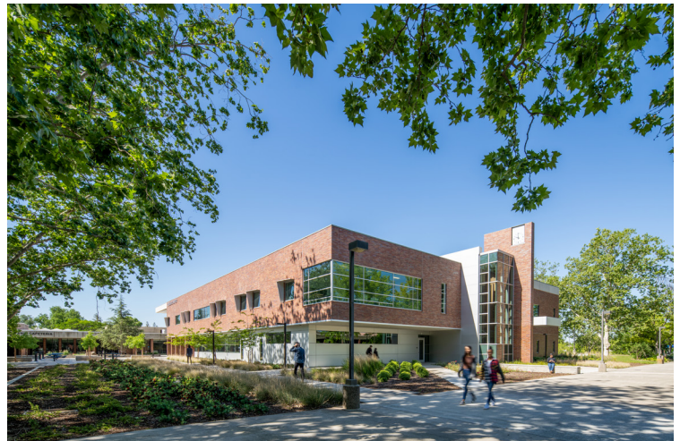
CRC College Center Expansion

This project provided a new monument sign at the west entrance of the Elk Grove Center. Total project funds from Measure M were $80,000.