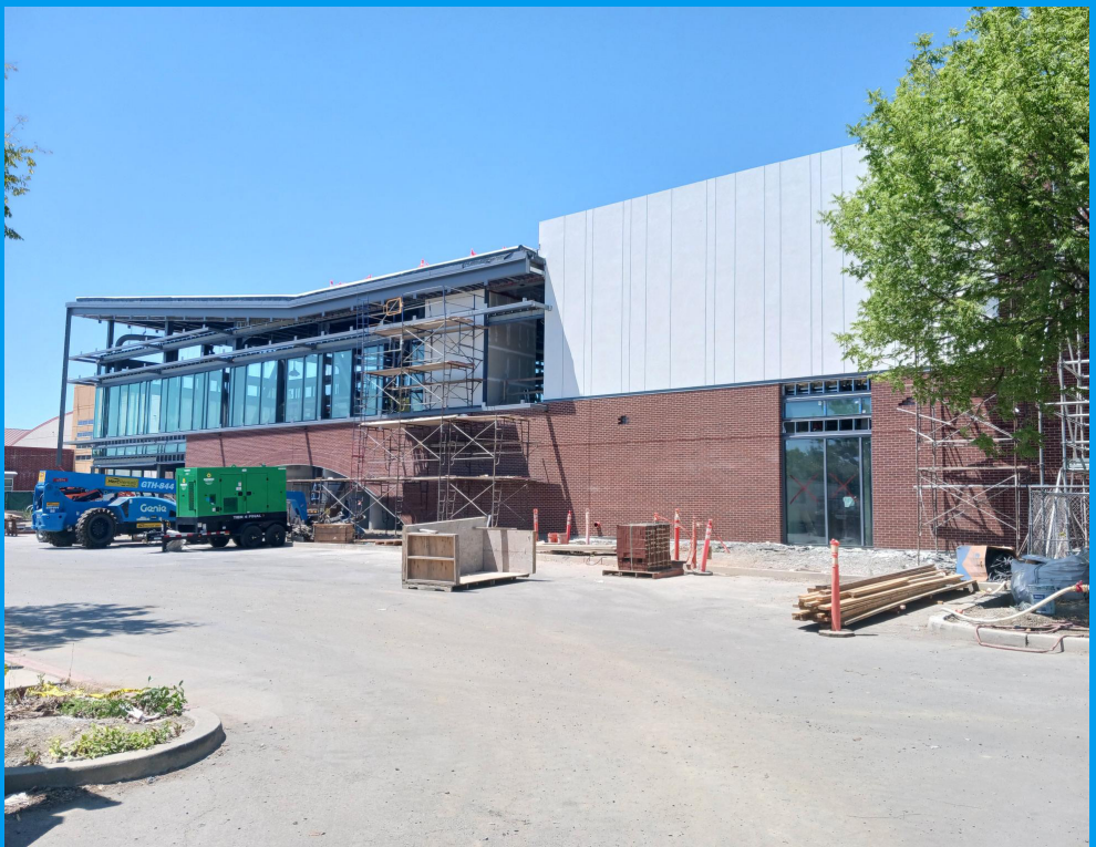
Natomas Center Phase II and III, American River College

American River College Cosumnes River College Folsom Lake College Sacramento City College